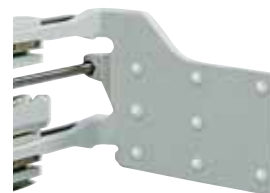
Optional Button Facing